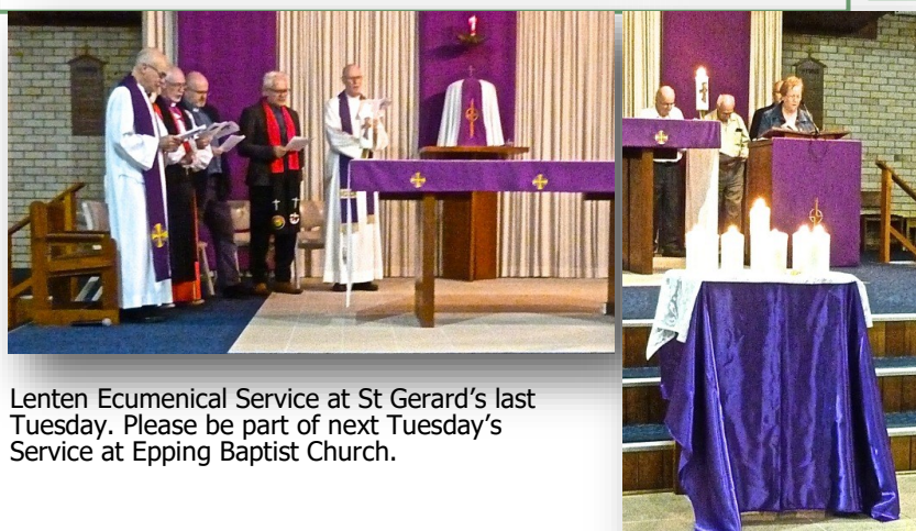
Lenten Ecumenical Service at St Gerard's last Tuesday. Please be part of next Tuesday's Service at Epping Baptist Church.

9/4 Epping Uniting Church Cnr Chester & Oxford Sts, Epping Preacher: Epping Baptist Church